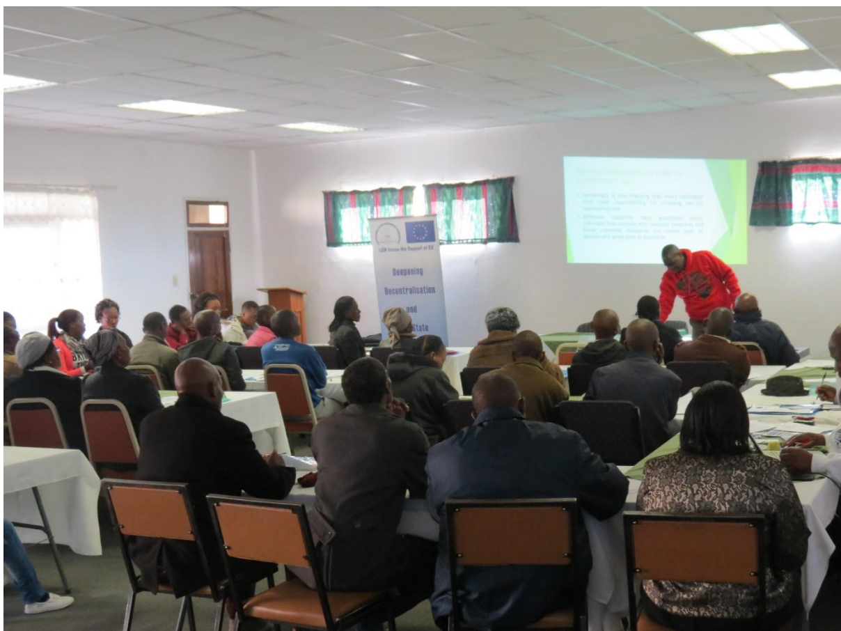
Participants during the Community Mobilisation workshop in Mafeteng